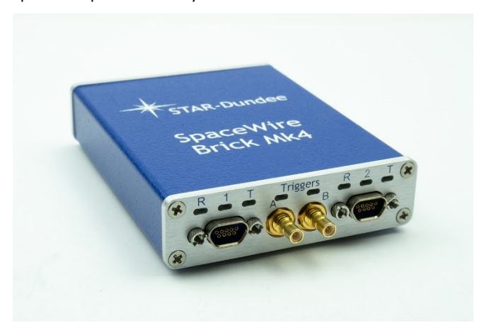
SpaceWire Brick Mk4

The SpaceWire Brick Mk4 provides two SpaceWire interfaces, support for high speed data transfer, the capability to inject various types of errors on demand, the ability to transmit and receive time-codes and act as a time-code master, and comes complete with highly optimised host software for low latency transmission of SpaceWire packets directly to and from the host PC.