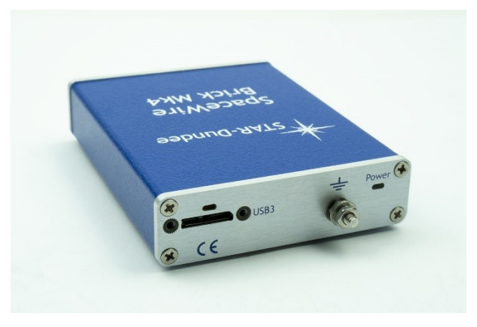
SpaceWire Brick Mk4 Rear Panel